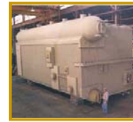
Shop assembled package boiler like those installed at BASF.

In October, Foster Wheeler was awarded a contract for two package boilers by BASF FINA Petrochemicals Limited Partnership (BFLP). We will supply two custom-designed, shop-assembled package boilers, each capable of producing 250,000 pounds per hour of high pressure, high temperature steam for BFLP's petrochemicals facility in Port Arthur, Texas. These boilers are among the highest pressure and highest temperature package boilers ever supplied by Foster Wheeler.